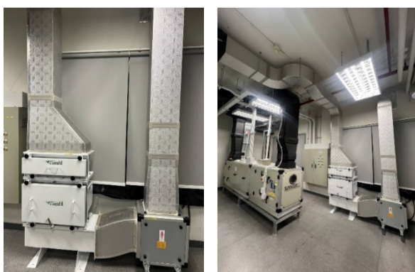
Figure 2 Camfil air filtration unit, Faculty of Engineering, Kasetsart University.