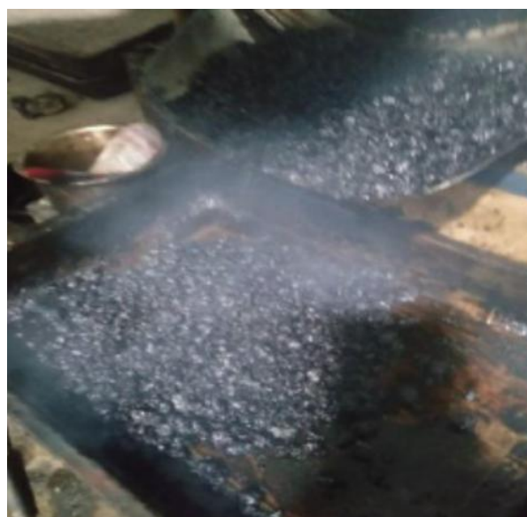
Figure 8. Asphalt Mixture