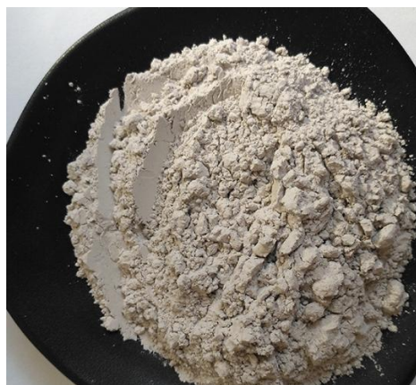
Figure 6. Mineral Powder