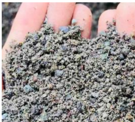
Figure 5. Fine Aggregate