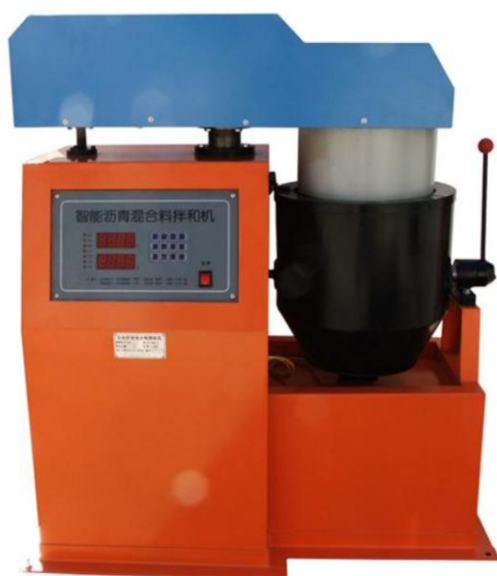
Figure 7. Asphalt Mixture Mixer

Note: Based on a total mixture mass of 1000 kg, the precise mass proportion of each material is given for different bamboo fiber content levels.