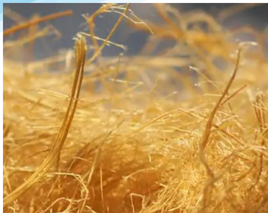
Figure 2. Bamboo Fiber