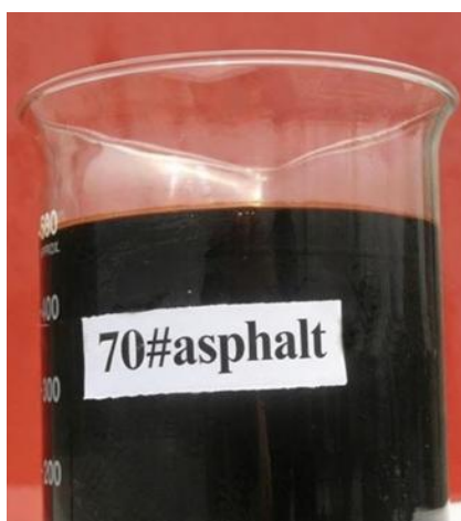
Figure 3. 70# A-grade road petroleum asphalt