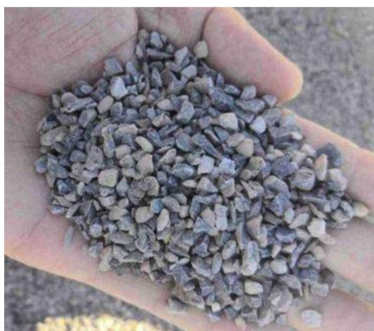
Figure 4. Coarse Aggregates