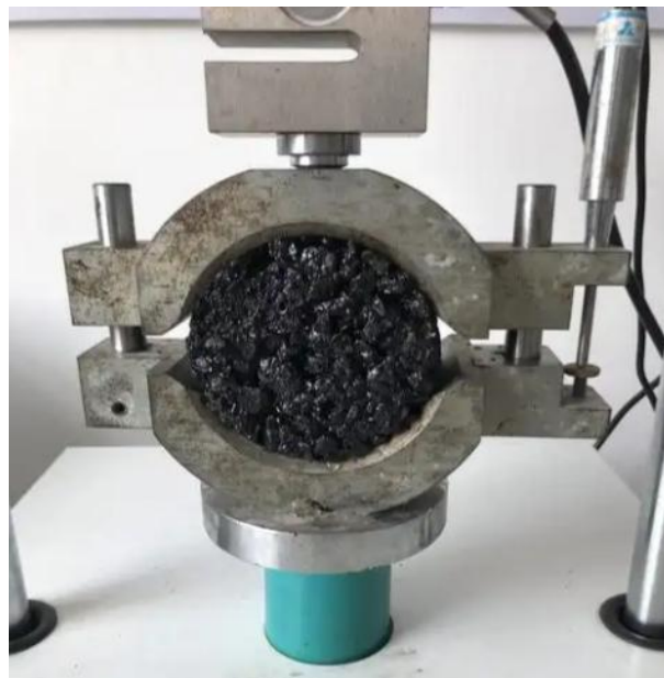
Figure 9. Marshall Test

Prior to testing, the specimens were preconditioned in a 60 °C constant-temperature water bath for 30–40 minutes and were then loaded at a constant speed of 50 mm/min until failure occurred. Marshall stability (MS, kN) and flow value (FL, 0.1 mm) were recorded to assess the mechanical performance of the mixtures.