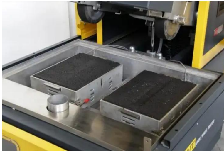
Figure 10. Rutting Test

Slab specimens were preconditioned in a 60 °C environmental test chamber for 5 hours, after which a wheel load with a contact pressure of 0.7 MPa was applied at a speed of 42 passes per minute. Dynamic stability (DS, passes/mm) and rutting depth (mm, measured at 60 min) were calculated to quantify the high-temperature rutting resistance of the mixtures. Dynamic stability served as the key index representing the number of wheel load applications required to produce 1 mm deformation of the specimen.