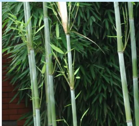
Figure 1. Local Cizhu from Luzhou